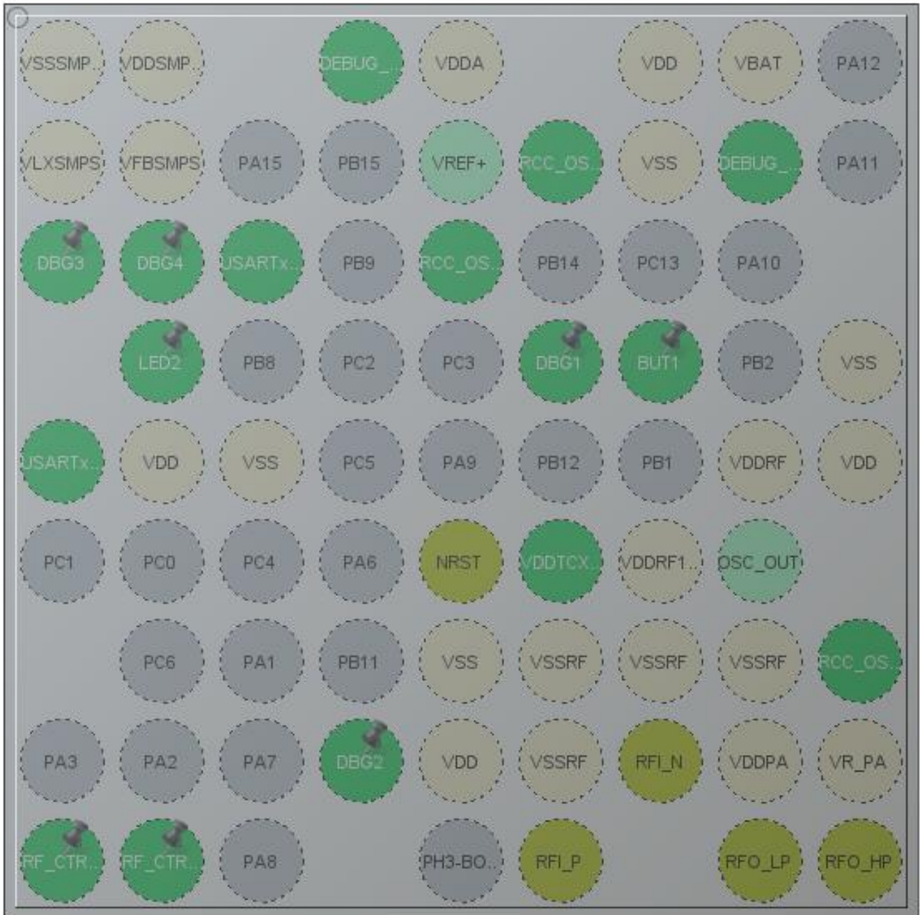
UFBGA73 (Top view)